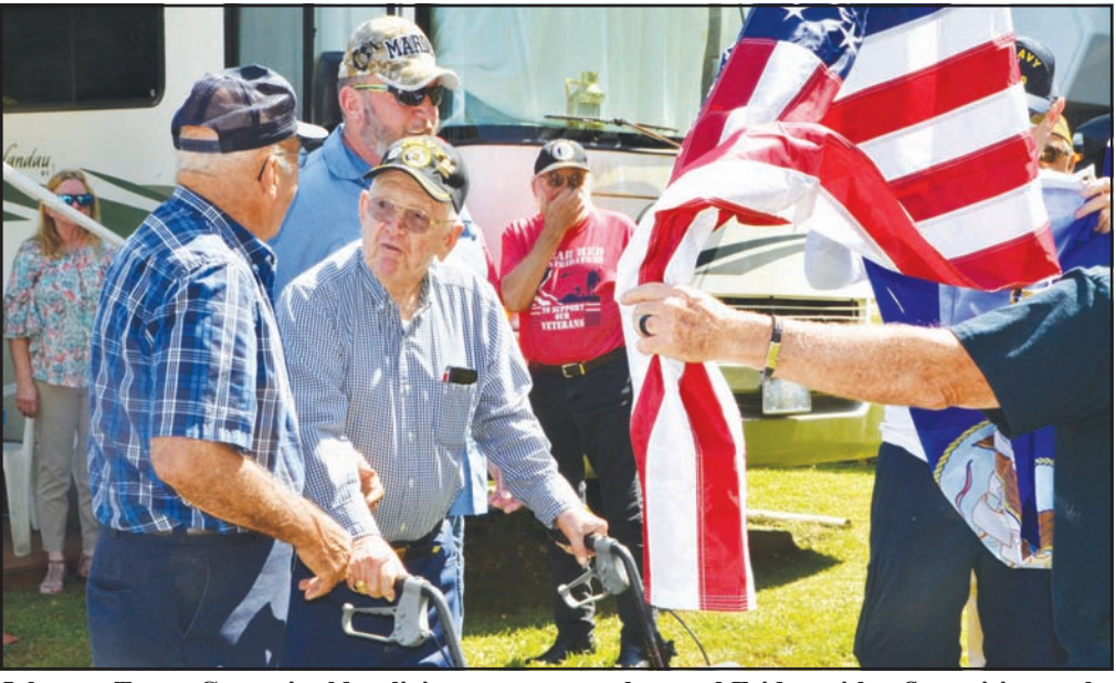
Johnson, Towns County's oldest living veteran, was honored Friday with a flag raising at the Hiawassee Campground's new flagpole.