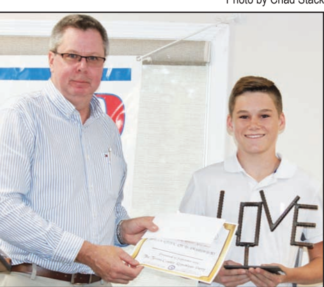
radshaw presenting local

Following the contest awards presentation, meeting host Samantha Church